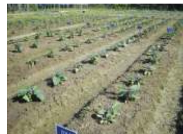
wPÎ: Pvi v tivcbKZ Rvq