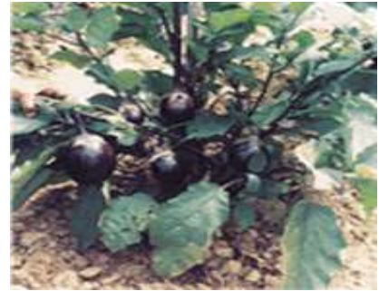
wPÎ: ewi te_b-5 (bqbZvi v)

Pvl vthwM` Rvgi cwigrY I tgvU Drcv` tbi w` K t_ tK te_b mewRmgfni gta` Ab`Zg| te_b mviv eQiB evRvfi cvl qv hvq| Bnv RbwçqI eU| cPwj Z KõU RvZ QrovI t` tki cZ` šIAA`tj Qwo tq wõU tq AvtQ eU RvZ Ges DcRvZ|