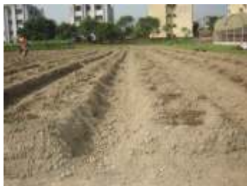
wPÎ: teW` Zix