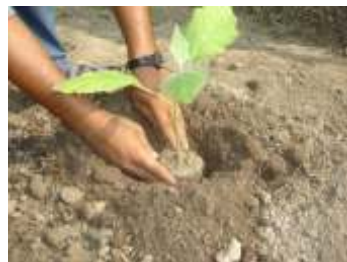
wPÎ: Pvi v tivcb